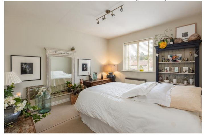
BEDROOM TWO 2.62 m (8'7") x 2.31 m (7'7") Casement window to the rear.

Casement window to the rear. Electric night storage heater.