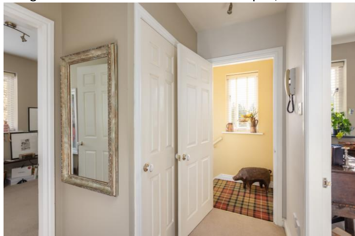
INNER HALLWAY Fitted coats cupboard. Loft inspection hatch.

Half glazed front door. Coats hooks. Stairs up to;